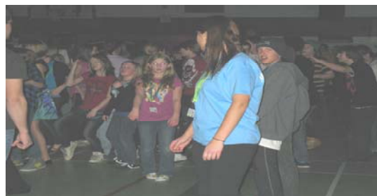
Athletes at the Much Music Dance Mix!

The Much Music Dance event was held in the gymnasium on Feb 16th from 8:00-10:30pm. Team North has been seen waving their hands in the air and having lots of fun! The athletes have been treated to ice cream and pizza throughout the night on their way to the Dance!