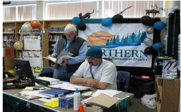
Mission Staff Decorating the Team North Mission Desk