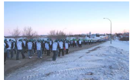
Walking to Opening Ceremonies with Police Escort