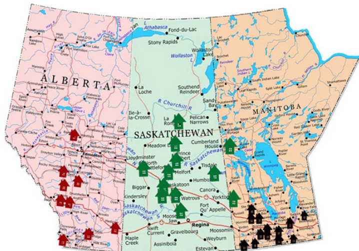
The Home Routes Circuit Map as it looks today. Alberta and Saskatchewan each have one circuit while Manitoba hosts two.